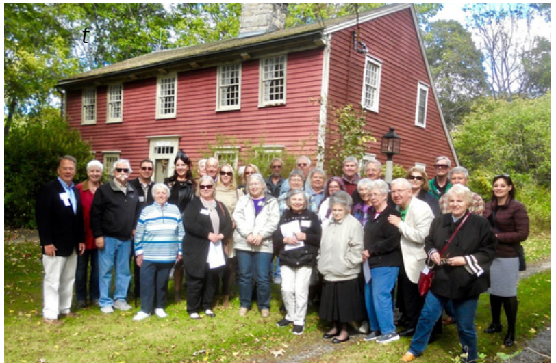
Photo: The Ephraim Hawley house